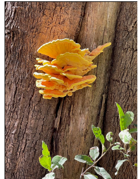
Fungus Among Us taken at Point Pinole.