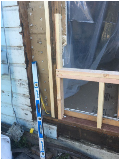
Window corner of 228 W. Macdonald Ave