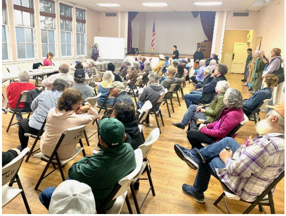
The first one was Nomination Night. The second is Weds, May 24, 2023.

In the spring there are two general membership meetings where member participation is necessary, as business cannot be conducted without a quorum (a minimum of 63 members).