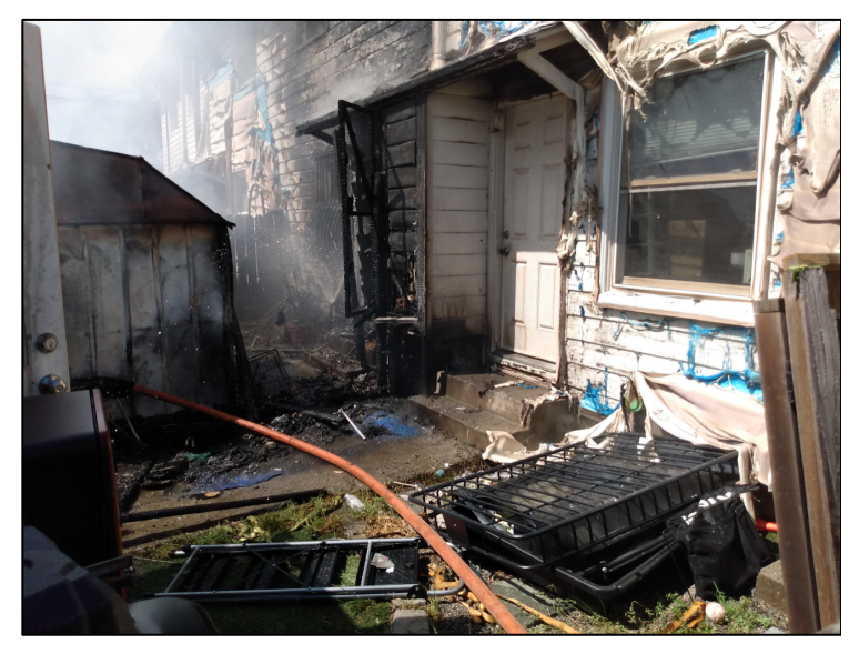
The May 9 fire destroyed 3 of the 4 units, shown here from the rear. No estimate on damages or cost to rebuild.

On May 9, on W. Bissell @ Curry, four 2-bedroom units were badly damaged in a 4-alarm fire. Richmond and El Cerrito Fire fought this blaze.